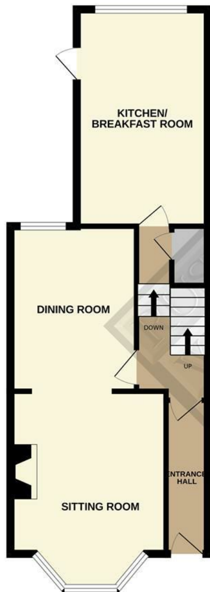
GROUND FLOOR 503 sq.ft. (46.7 sq.m.) approx.