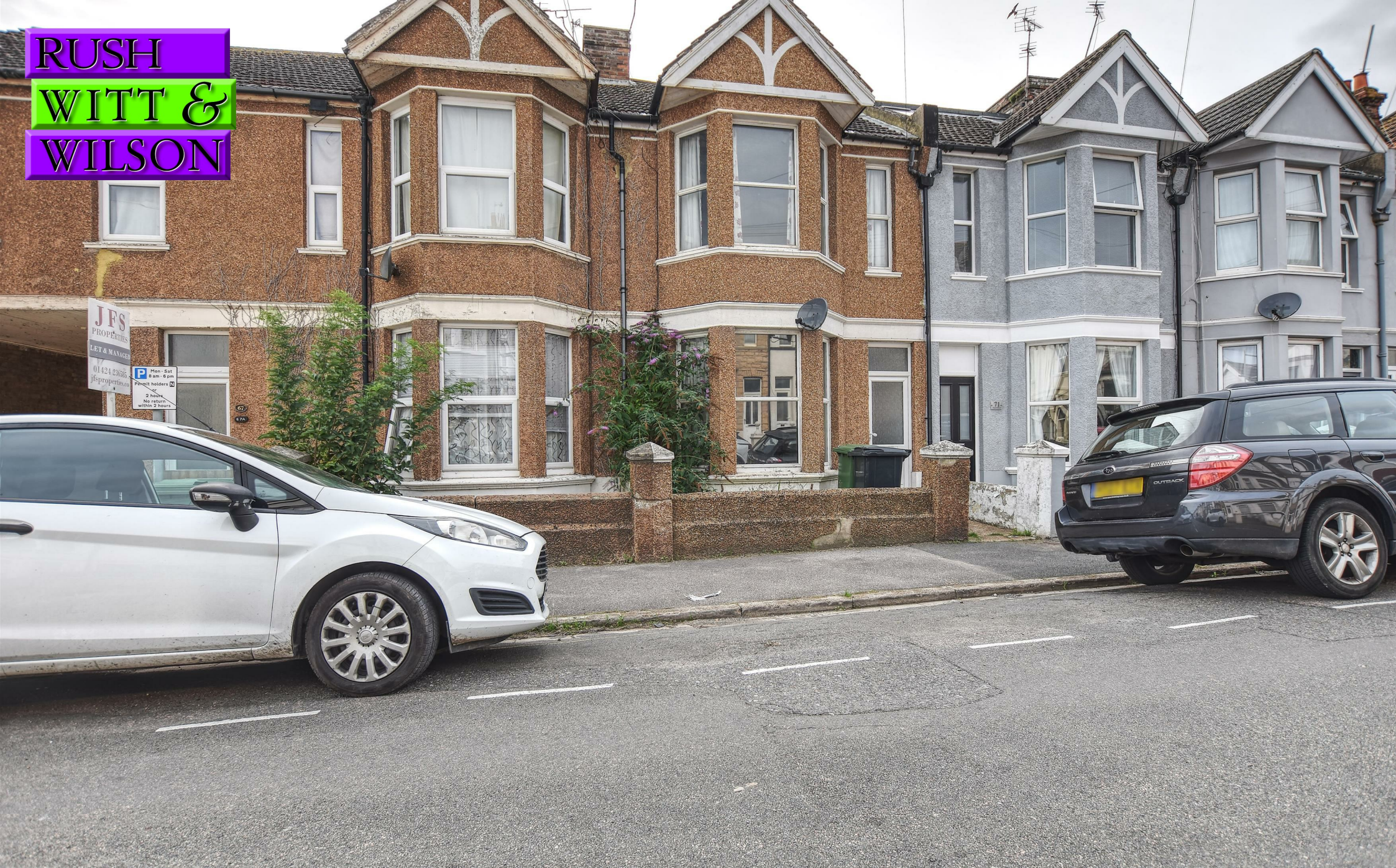
69 Reginald Road, Bexhill-On-Sea, East Sussex TN39 3PQ £259,000